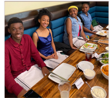
Etiquette Workshop April 2023