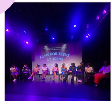
Films for Teens By Teens June 2023