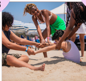
End of Year Bash June 2023