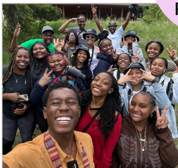
Restoration Retreat June 2023