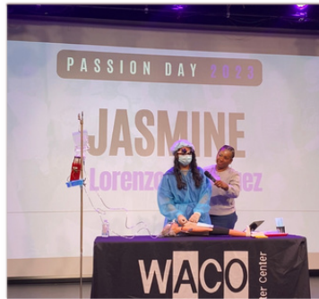
Passion Day March 2023