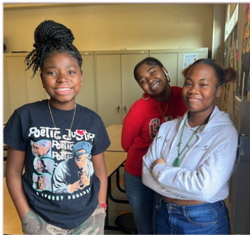
Vision Board Workshop February 2023

The program curriculum includes off site field trips and workshops with guest artists to foster skill development and awareness of the arts and future careers.